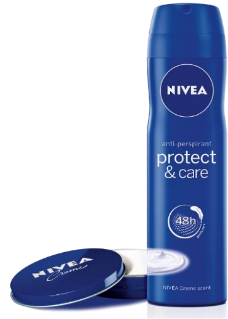
Protect & Care